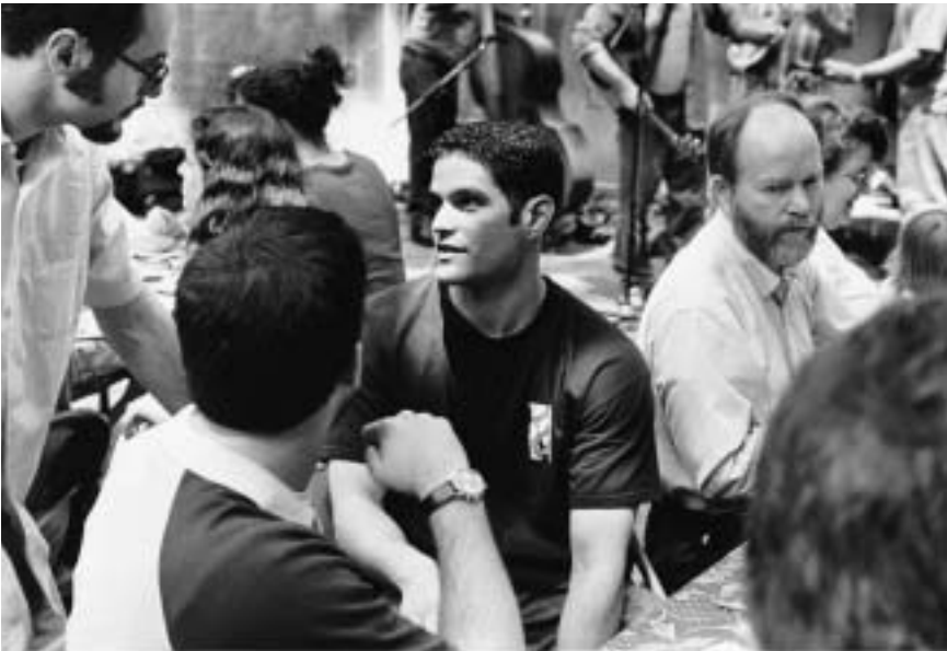
A spring Wednesday Lunch in Swift courtyard

9. Information on academic programs, faculties, and facilities can be obtained from the Dean of Students' Office in the Divinity School.