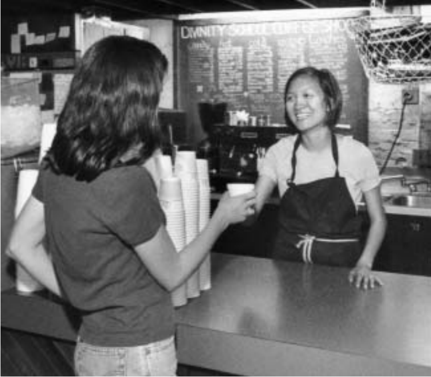
The student-run coffee shop, located in the basement of Swift Hall, is one of the most popular meeting places on campus