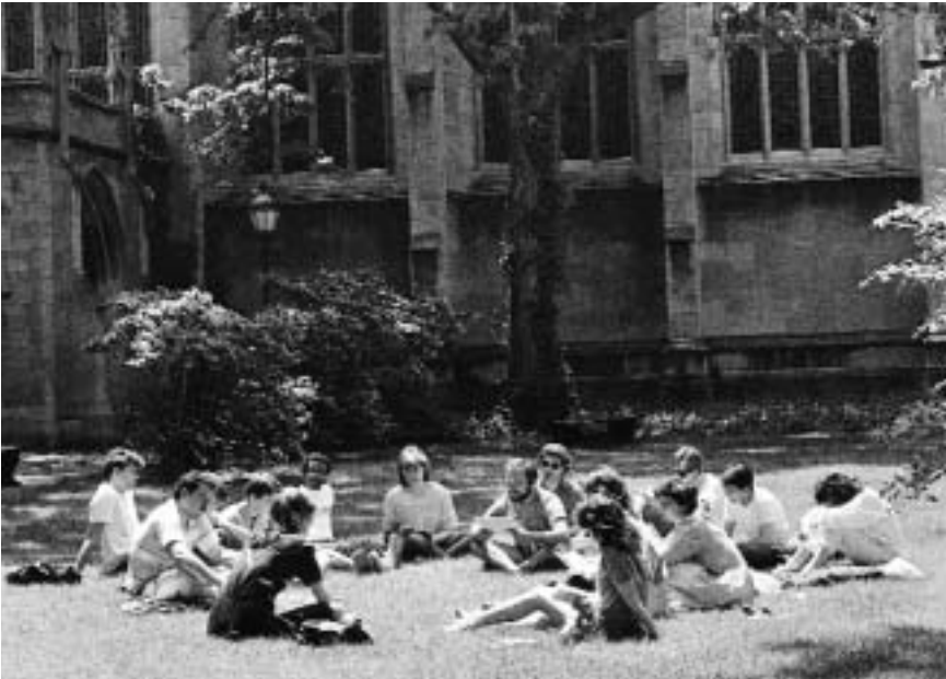
A class meets in front of Bond Chapel in spring